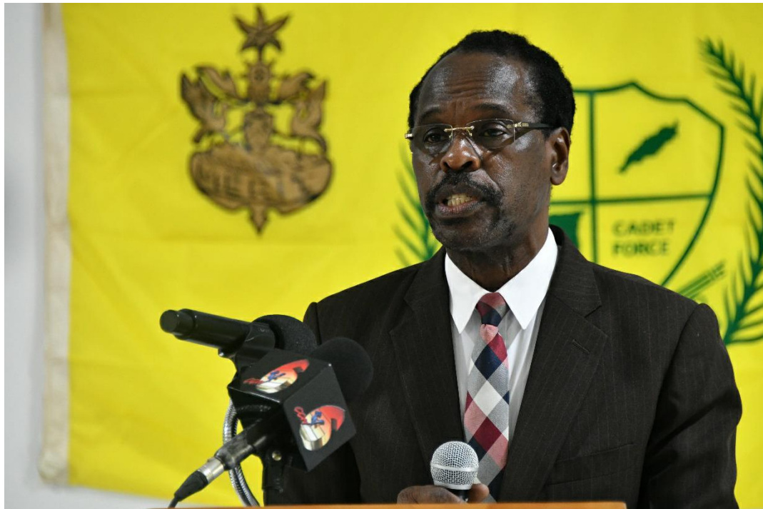
Photo 1: Minister of National Security the Honourable Fitzgerald Hinds M.P. addresses Cadets at the opening ceremony of the Cadet Force "Operation Recovery" Training Camp, held at the Defence Force Joint Training Academy in Corinth.