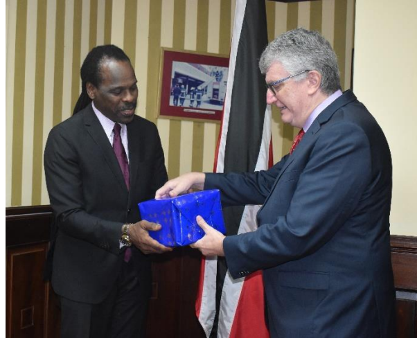
Caption: Minister of National Security, the Honourable Fitzgerald Hinds M.P. exchanges tokens of appreciation with Ambassador Extraordinary and Plenipotentiary of the Republic of France to Trinidad and Tobago, His Excellency Didier Chabert during a courtesy call on August 12, 2022 at the Ministry of National Security's Head Office on Abercromby Street, Port of Spain.