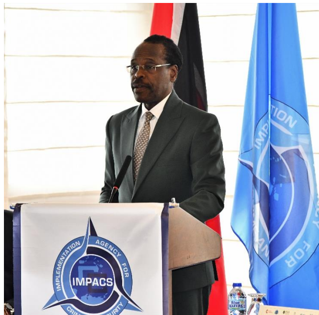
Photo 1: Minister of National Security the Honourable Fitzgerald Hinds M.P. delivered the Keynote Address during the Pre-Operational Meeting: Operation CARISICA (OCASI) , at the Hilton Trinidad and Conference Centre, on Monday 24 April, 2023.