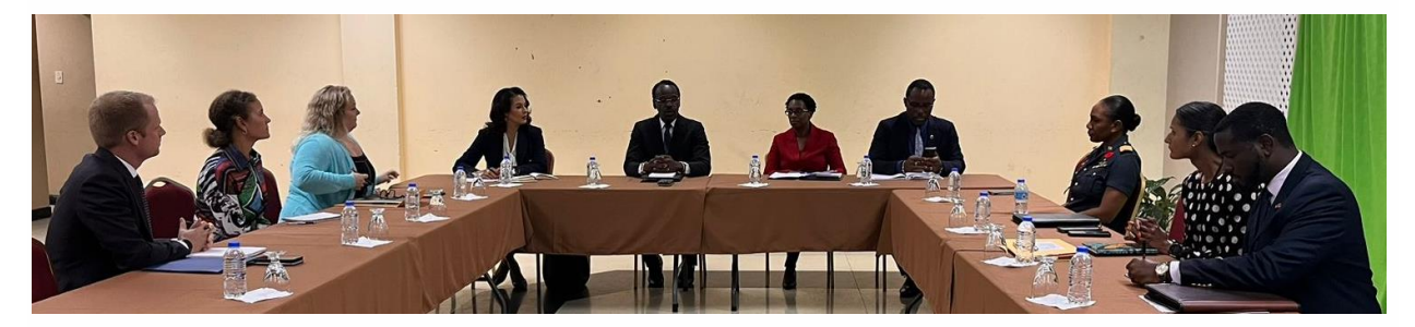
Photo 2: Minister of National Security, the Honourable Fitzgerald Hinds MP hosted a meeting with the Ambassador of the United States of America to Trinidad and Tobago, Her Excellency Candace Bond, officials from the Ministry of National Security and the US Embassy on Wednesday October 25, 2023 at the Ministry of National Security's Head Office, Abercromby Street, Port of Spain.

Photo 1: Minister of National Security, the Honourable Fitzgerald Hinds MP; Ambassador of the United States of America to Trinidad and Tobago, Her Excellency Candace Bond; officials from the Ministry of National Security and the US Embassy met on Wednesday October 25, 2023 at the Ministry of National Security's Head Office, Abercromby Street, Port of Spain.